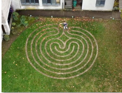
Mount Tabor Presbyterian Church, Portland, Oregon