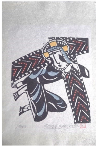
Watanabe, Sadao. Christ Carrying His Cross . 1968. Used with permission.